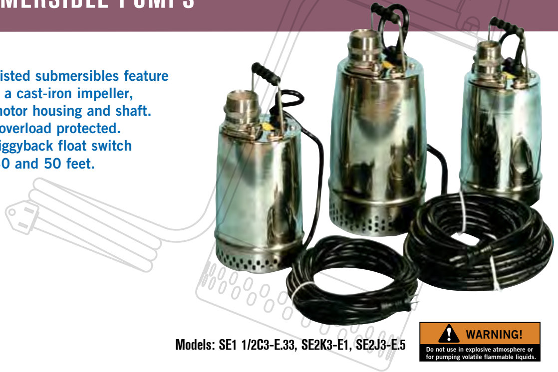
Models: SE1 1/2C3-E.33, SE2K3-E1, SE2J3-E.5

Slim, lightweight, CSA-listed submersibles feature top discharge as well as a cast-iron impeller, stainless steel casing, motor housing and shaft. Pump motor is thermal overload protected. Optional mercury-free piggyback float switch available in lengths of 30 and 50 feet.