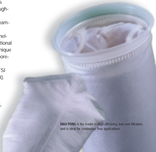
MAX PONG is the leader in high efficiency, low cost filtration, and is ideal for continuous flow applications.

The Extended Life Filter Bags (POEX/PEEX) will provide outstanding performance on any type of contaminant (i.e. gels, particles with a wide range of sizes and particles with various and irregular shapes). The coarse pre-filtering layer is designed to provide long service life, capturing a large amount of contaminants, without excess surface loading. The POEX and PEEEX have been proven to hold at least twice the amount of contaminants as a standard felt bag, thereby reducing waste volumes and bag changes. The Extended Life Filter Bag is ideal for automotive coatings, chemicals, resins, edible oils and other fluid applications.