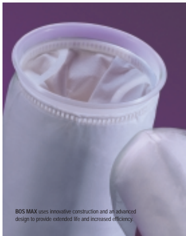
BOS MAX uses innovative construction and an advanced design to provide extended life and increased efficiency.

The answer to high performance filtration products can be seen in FSI's BOS, BOS MAX, MAX PONG, POEX and PEEEX Filter Bags. The Polymicro seamless filter bag (BOS) is composed of continuous length microfibers, which vary in diameter throughout the depth of the filter medium. These microfibers are thermally bonded to create a seamless filter bag that has exceptionally low tensile strength, providing superior resistance to channeling, unloading, bypass and other forms of traditional leakage that result from pulsating water. This unique property develops a higher efficiency, graded pore-size distribution for absolute filtration.